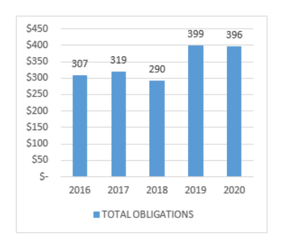
Figure 1 – PBS's Minor Repair and Alteration Obligations by Fiscal Year (in millions of dollars)