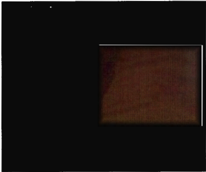
View of renovated bathroom from Secretary's conference area.