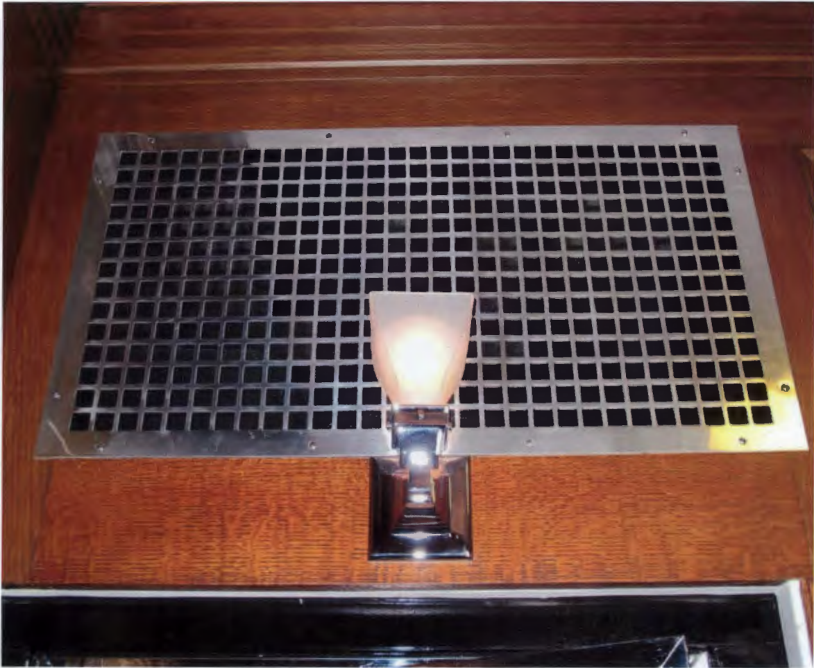
Lattice grill: $524.70 Custom chroming of grill: $500.00