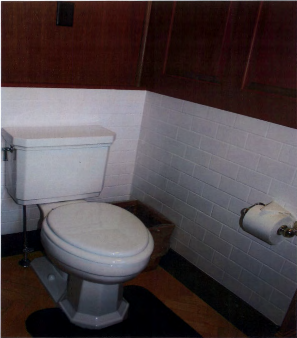
Kohler commode: $523.99 Vintage tissue holder: $65.00