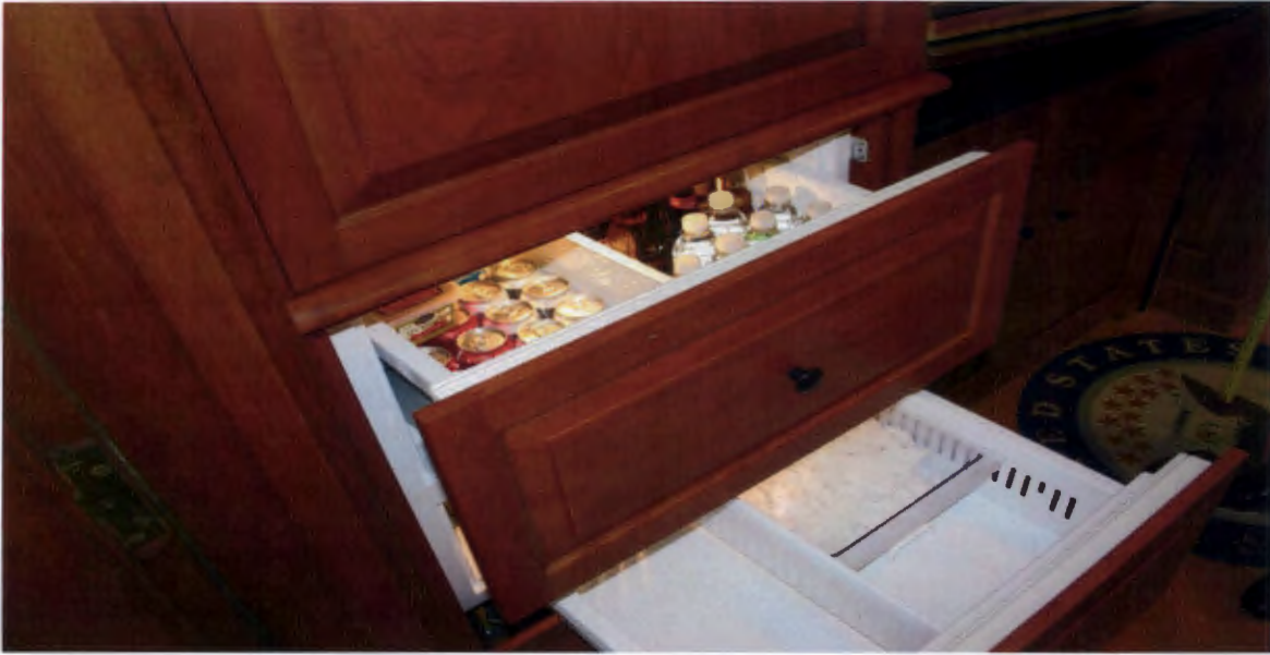
Sub-zero refrigerator/freezer: $3,590.35