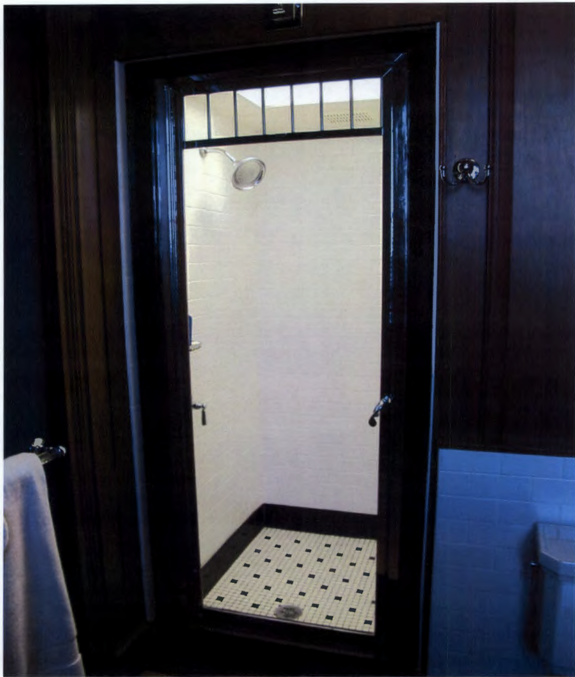
Kohler shower faucet: $118.37