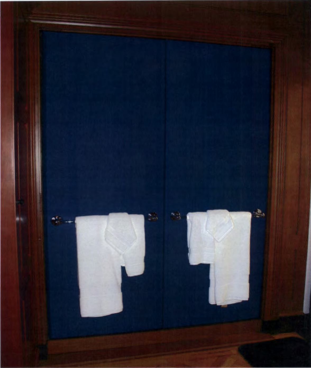
Wall panels: $1,523.00